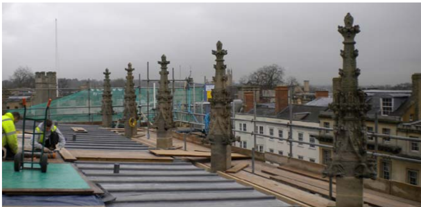
Roof works for St Mary the Virgin Church, High Street, Oxford