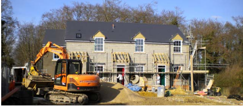
New housing development for Witney Mills Housing Society