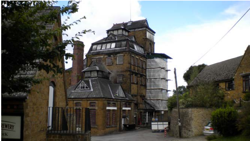
Hook Norton Brewery

Under the CDM Regulations 2007, before any significant design work is permitted to take place on a project, the client must be made fully aware of all their many responsibilities, including the early appointment of a CDM Co-ordinator. Depending on the size and complexity of the project, this brief could take some time and can be expensive for the design team to deliver. It is a potential source of ambiguity, confusion and even litigation to those not fully up to date with the continually evolving Health and Safety requirements.